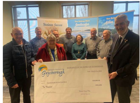
Guysborough & Area Food Bank $10,000