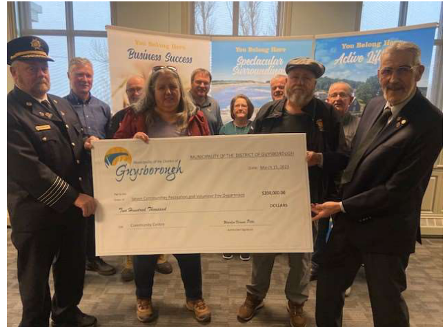
Seven Communities Volunteer FD Community Centre $200,000