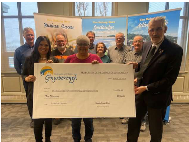
Chedabuto Education Centre/Guysborough Academy Breakfast Program $10,000