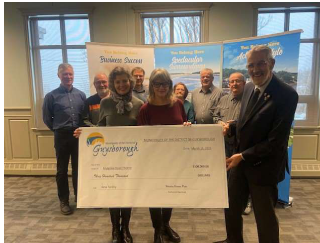
Mulgrave Road Theater $300,000