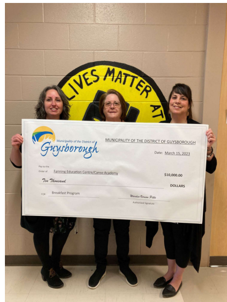
Fanning Education Centre/Canso Academy Breakfast Program $10,000